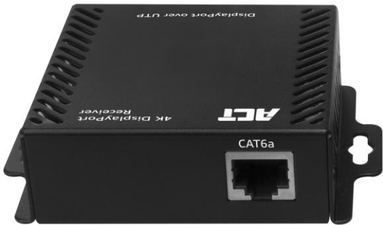
Front Panel Transmitter and receiver unit