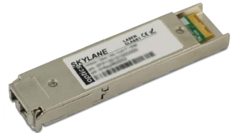
Figure 1. XFP Dual Fibre (non-binding illustration)