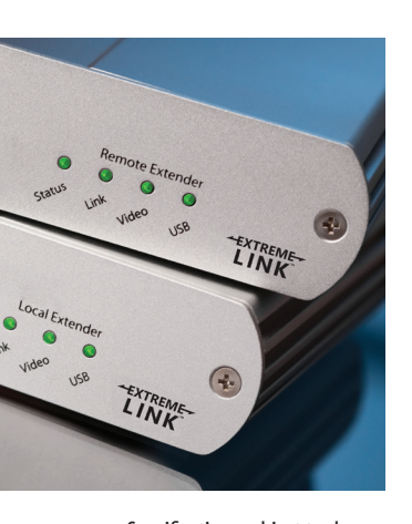
Specifications subject to change without notification. © 2011 Icron Technologies Corp. #90-00909-A01