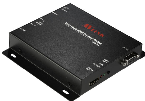
Repeater Unit (HE-A2RS)