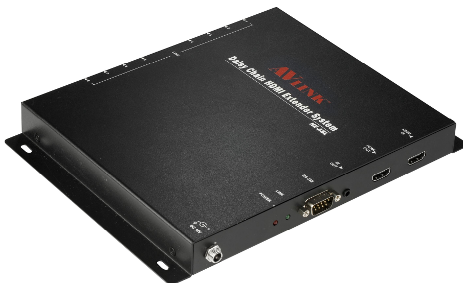
8-Port Distribution Amplifier (HE-A8L)