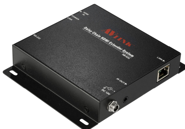
Local Unit (HE-A1L)