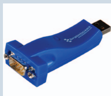
US-101: USB 1 Port RS232 1MBaud