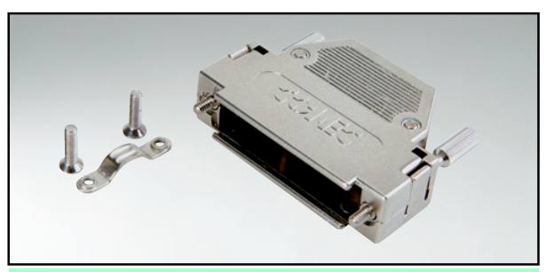
RoHS compliant – CSA listed, File No.: LR 115000-1 – UL listed, File No.: E202784

Straight cable entry - 9-50 pos. - With jack screws