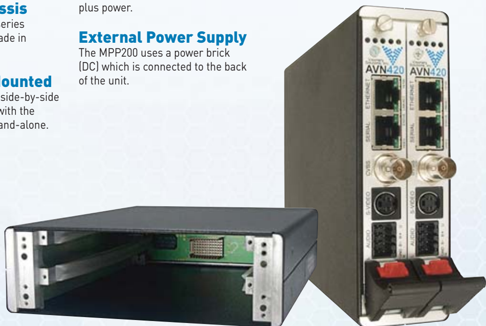
The MPP200 shown empty and with two AVN420 encoder blades installed

The MPP200 uses a power brick (DC) which is connected to the back of the unit.