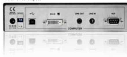
Tx Unit rear Aspect

AdderLink INFINITY delivers crystal clear stereo audio digitally across the network. This ensures continuous fidelity and channel separation between the Tx and Rx units, or even in Multicast environments.