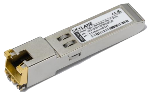
Figure 1. SFP Copper (non-binding illustration)