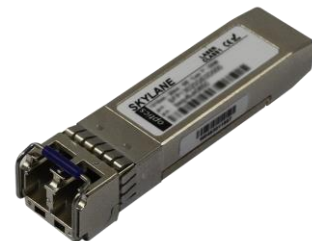
Figure 1. SFP Dual Fiber 1310nm (non-binding illustration)