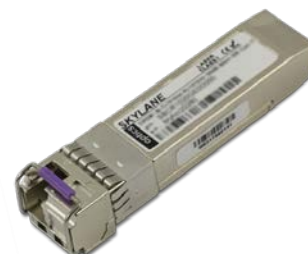
Figure 1. SFP Single Fiber (non-binding illustration)