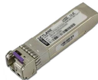
Figure 1. SFP Single Fiber (non-binding illustration)