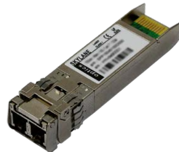
Figure 1. SFP+ Dual Fiber 1310nm (non-binding illustration)