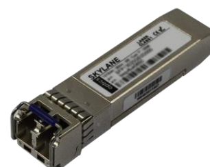
Figure 1. SFP Dual Fiber 1310nm (non-binding illustration)