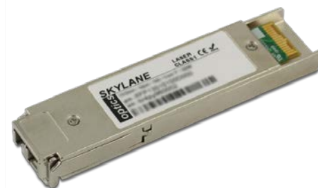
Figure 1. XFP Dual Fibre (non-binding illustration)