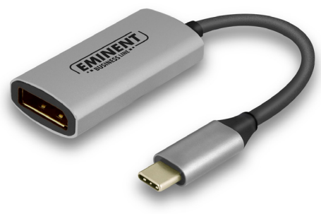
VideoConverter 4KSupport 4KSupport 4096 x 2160@60Hz