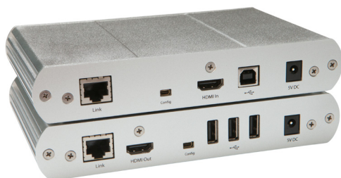
Rear view of LEX (top) and REX (bottom)