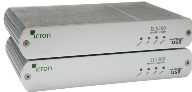
LEX (Local Extender)

The EL5200 extends both HDMI and USB 2.0 up to 100m using a single Cat 5e* cable.