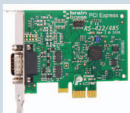
PX-320: LP PCIe 1xRS422/485 1MBaud