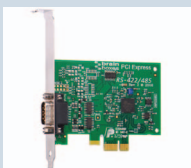
PX-324: PCIe 1xRS422/485 1MBaud