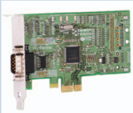
PX-235: LP PCIe 1xRS232 1MBaud