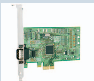
PX-246: PCIe 1xRS232 1MBaud