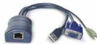
Example CAM: CATX-USB-A

Master power switch for connection to AdderView CATxIP 1000 or standalone Ethernet operation: PSU-8MASTER