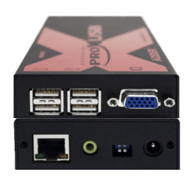
ADDERLink X-USB PRO - Remote