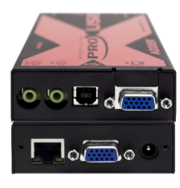
ADDERLink X-USB PRO - Local