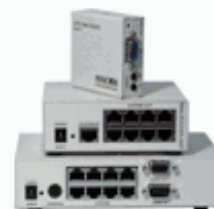
VDS Family Back

International HQ T: +41 44 823 8000 F: +41 44 823 8005 ds@minicom.com