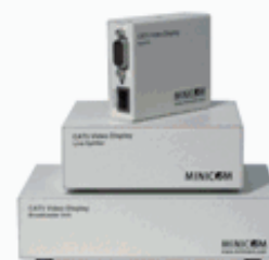
VDS Family Front