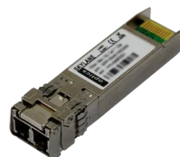
Figure 1. SFP+ Dual Fiber (non-binding illustration)